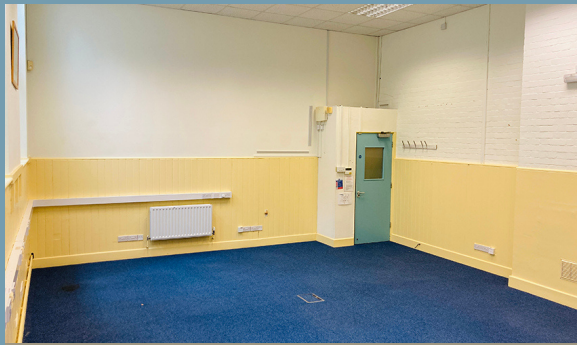
UNIT 2 APPROX. 548 SQ. FT. (51 M. SQ.)