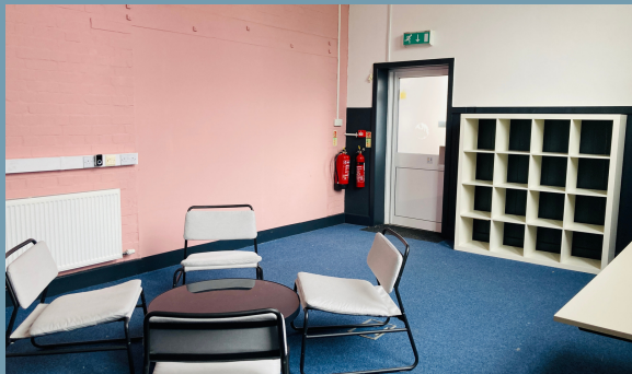
UNIT 2A APPROX. 291 SQ. FT. (27 M. SQ.)

Units 2 and 2A are now available to rent either all together, as a combination of units or separately.